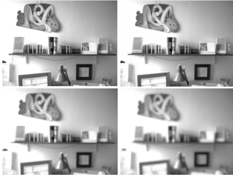
Figure 1: Indoor scene: Focused image (top left), slight out-of-focus (top right), medium out-of-focus (bottom left), heavy out-of-focus (bottom right).

We present here one of the experiments we have done. A static indoor scene was captured four times by digital camera (see Fig. 1). The first image was taken using camera autofocus, the others were manually defocused in such a way that the degree of out-of-focus was changing gradually from slight to heavy.